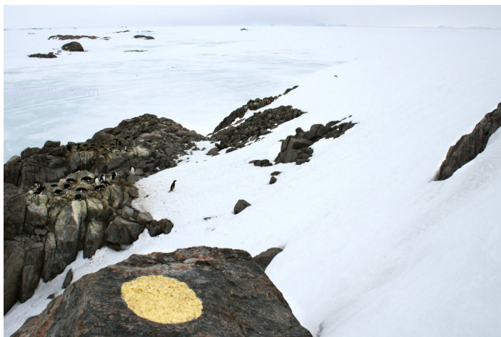
« Antarctic consciousness » Pure gold on a rock Adelie Land, Antarctica