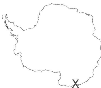
Location of the GAMMA exhibition, Dumont d'Urville station, Adelie Land, Antarctica.

Dates and places of the GAMMA exhibition 2018 to be released in: www.oijha.com and facebook.com/oijhafromantarctica